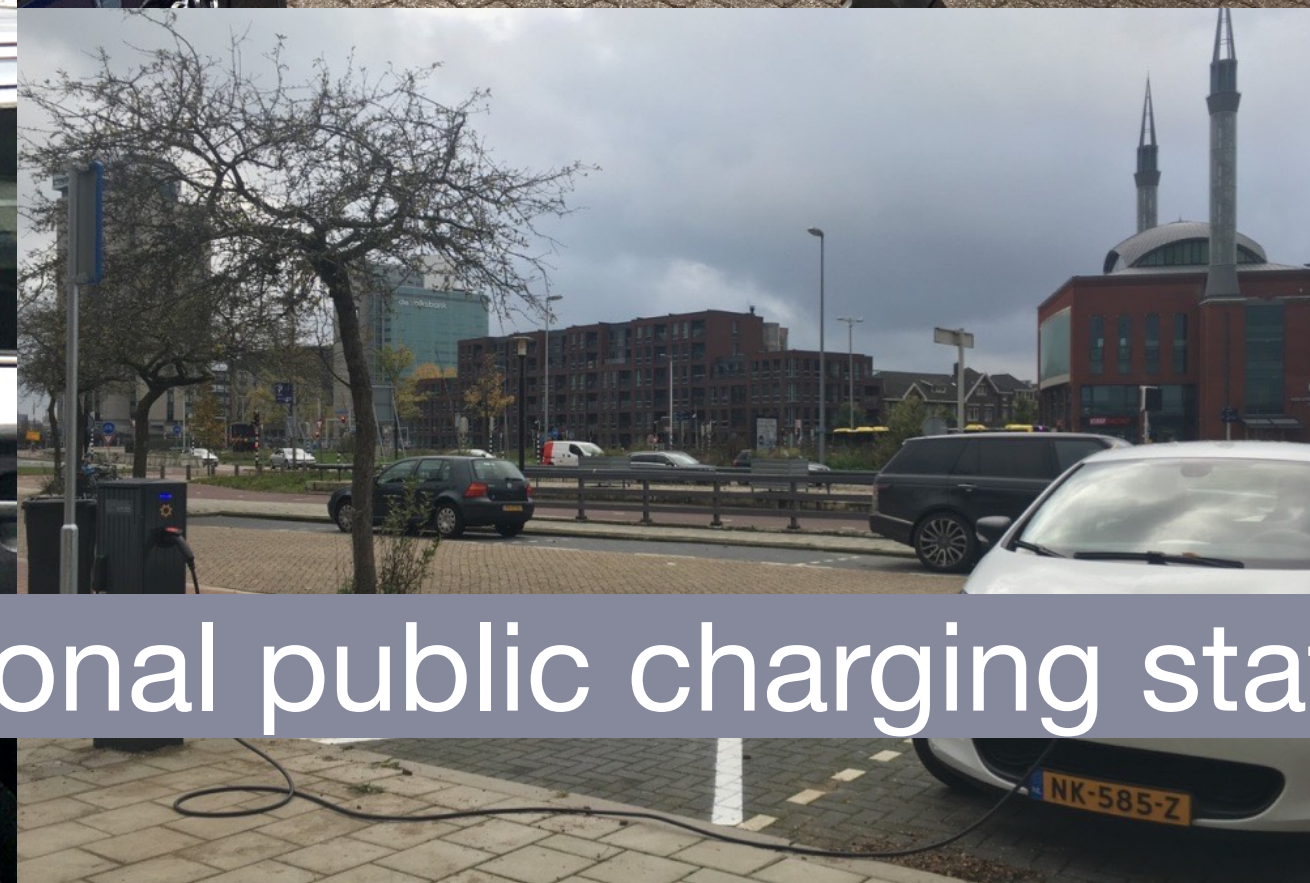
Utrecht 500 bidirectional public charging stations