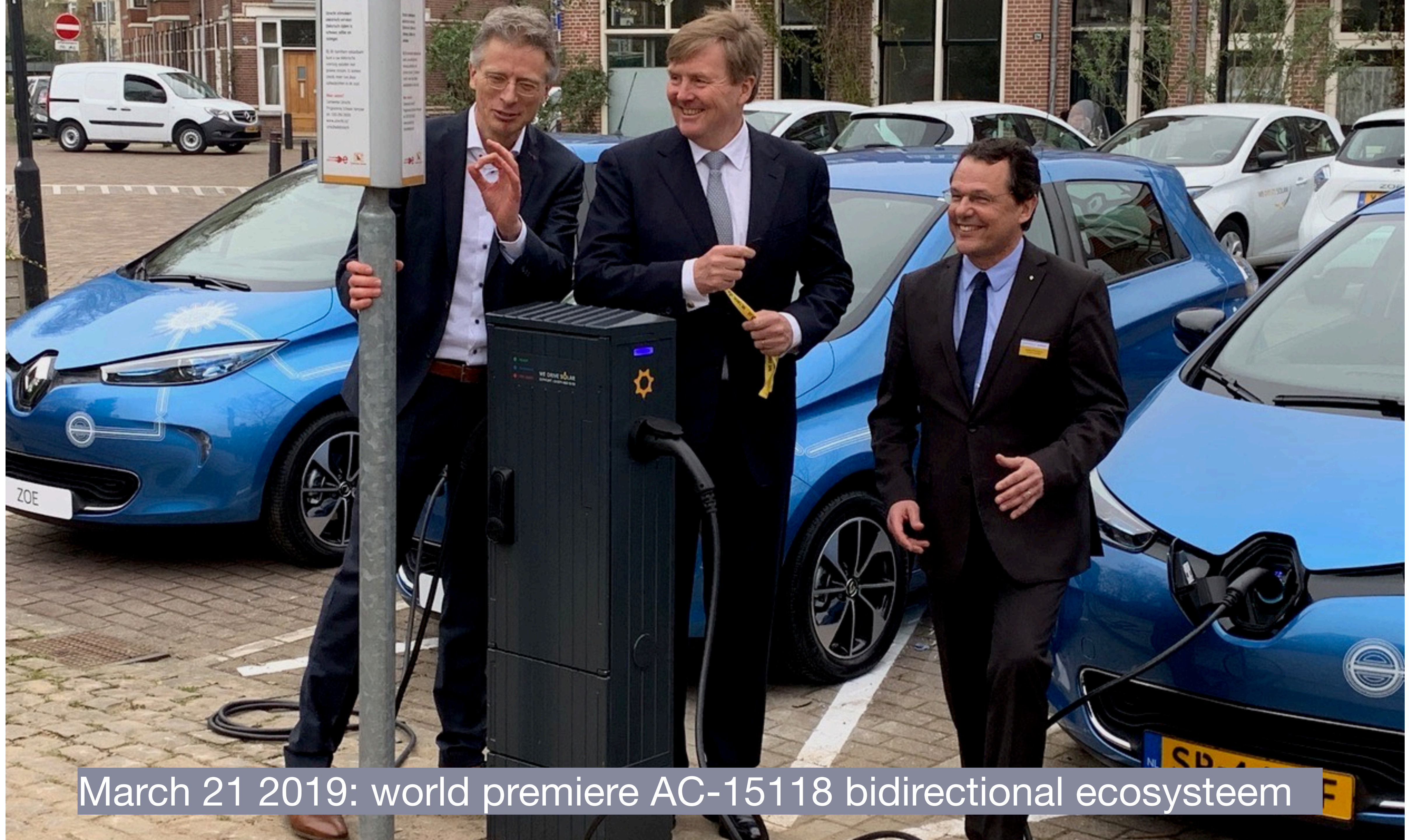
March 21 2019: world premiere AC-15118 bidirectional ecosysteem