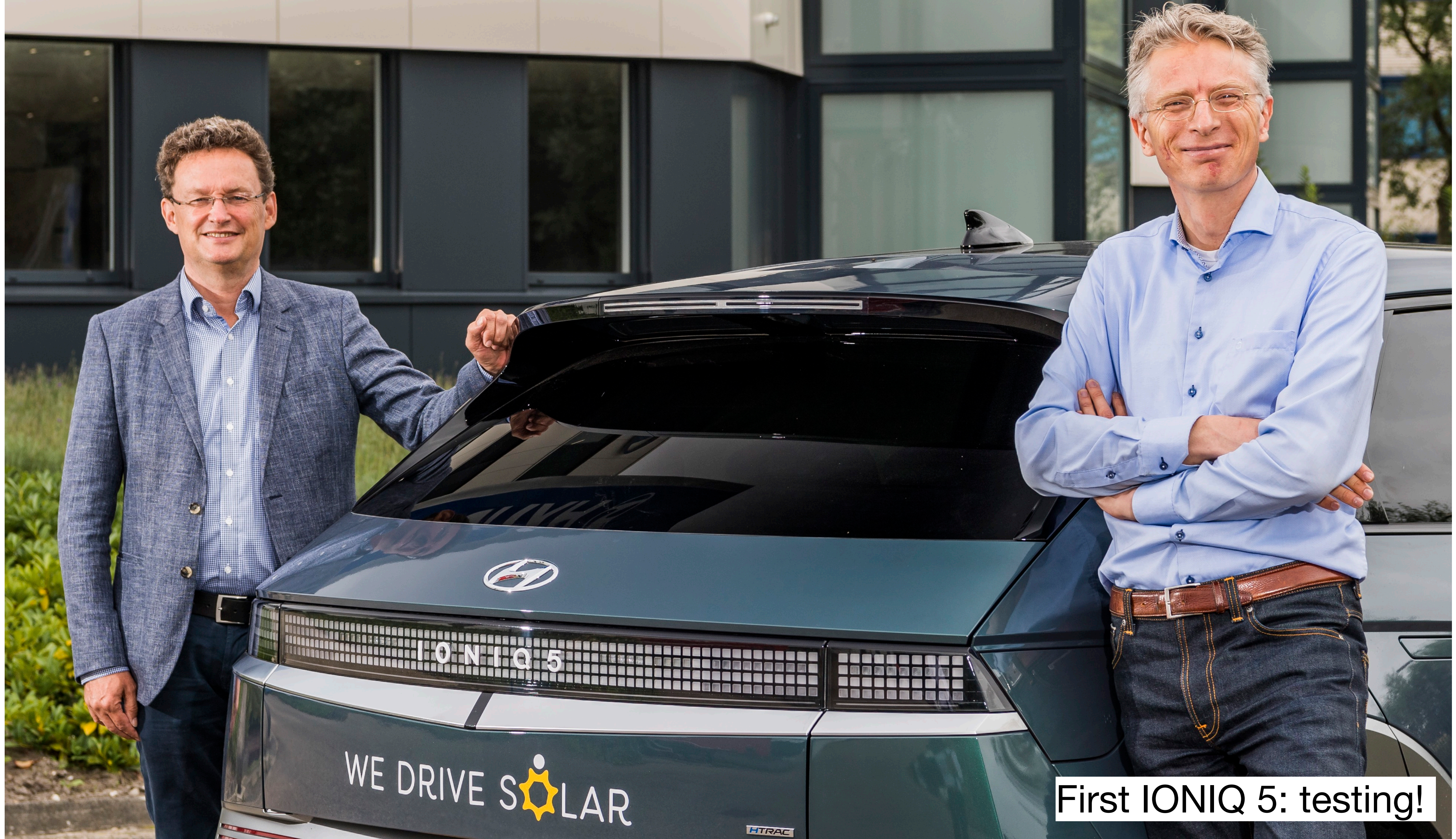
First IONIQ 5: testing!